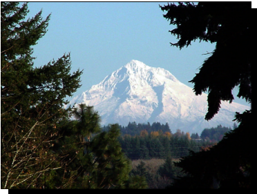
A view of majestic Mt. Hood from our backdoor.

N orthwest Behavioral Healthcare Services provides residential services to troubled youth, ages 12 to 17 who meet clinical admission criteria. The staff of Northwest has shown itself to be successful with those more “difficult to treat” — especially those with a dual diagnosis who require a secure setting for their care.